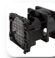
Fan holder for front 80 mm fan and rear 60 mm fan