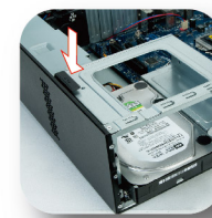
Device locking and releasing latch

Front Control : USB 2.0 x 2 + USB 3.0 x 2 (Option)