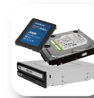
Tool-less installation for ODD 3.5" HDD and 2.5" HDD