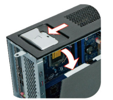
Tool-less side cover